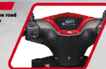
DIGITAL CLUSTER WITH LCD

DRL's to ensure safety on the road with ease of visibility