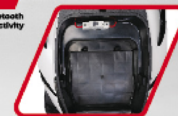
SUFFICIENT STORAGE SPACE

Digital LCD cluster with Bluetooth connection for Smart connectivity