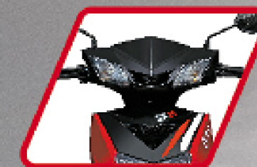
FOLLOW ME HEAD LAMP

DRL's to ensure safety on the road with ease of visibility