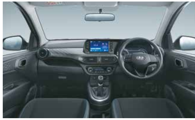
Black interiors with aqua teal inserts available in :