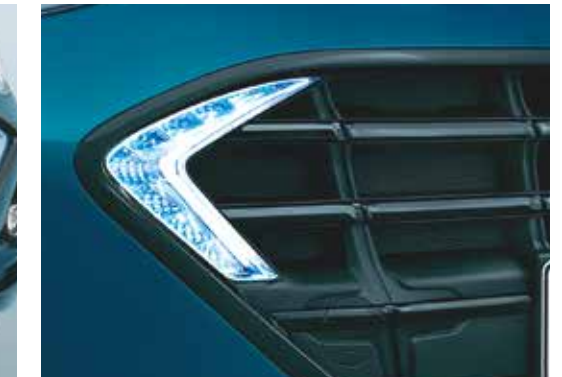
Boomerang shaped LED DRLs