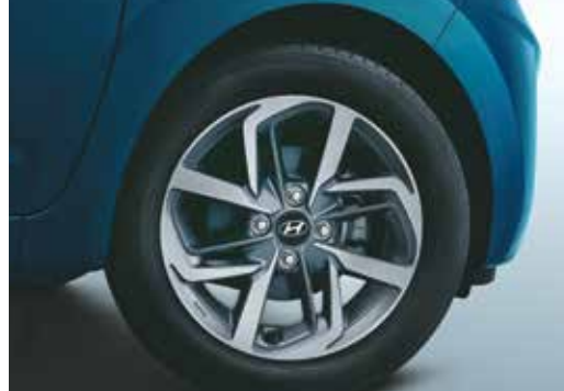
R15 (D=380.2 mm) diamond-cut alloy wheels