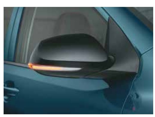
Electric folding outside mirror with turn indicator