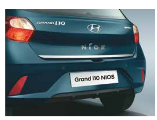
Rear chrome garnish