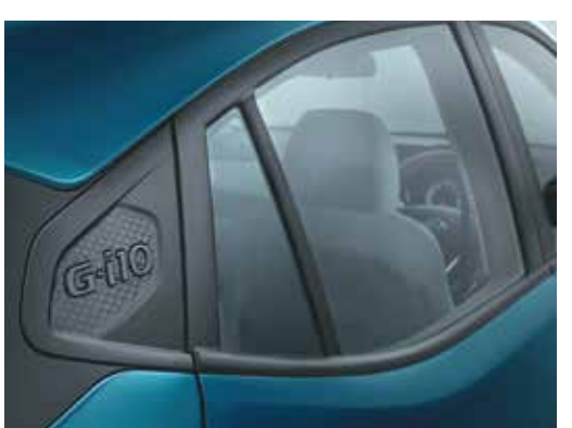
Unique G-i10 branding on C pillar