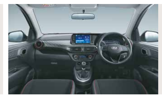
Black interiors with red inserts available in :