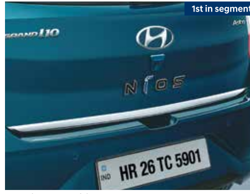
Rear chrome garnish