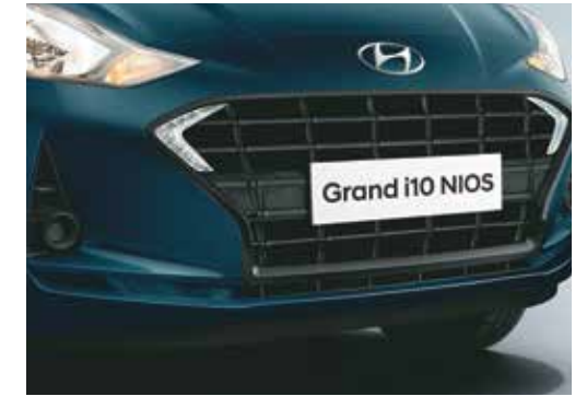
Glossy black radiator grille