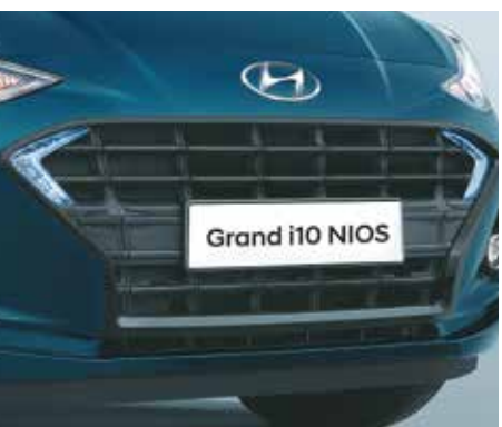
Glossy black radiator grille*