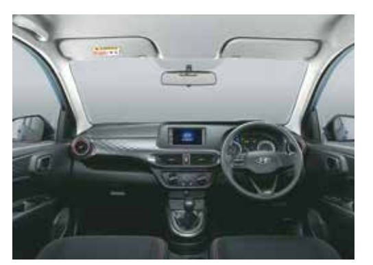
All black interiors with red colour inserts