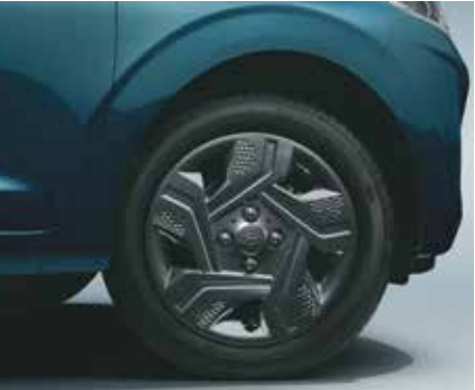
175/60 R15 (D=380.2 mm) Gun metal styled wheel

Step into the world of high-powered executives with the bold Grand i10 Nios corporate edition. A seamless blend of cutting-edge technology and new age style makes it the perfect statement for the young professional. Subtle details accentuate the corporate edition, like all-black interiors with red inserts, elegant chrome garnish and a 17.14cm touchscreen infotainment system, ensuring that you'll have a truly extraordinary driving experience.