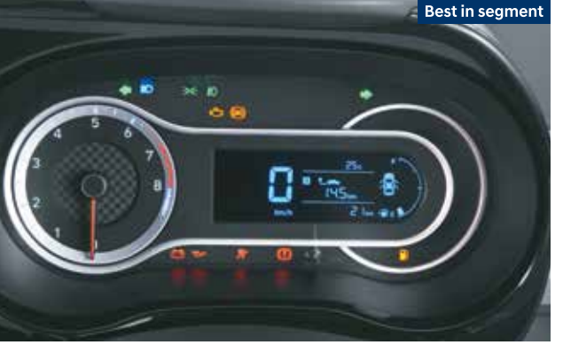
13.46 cm (5.3") digital speedometer