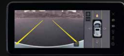
Front 2D View

Step into the future of convenience, where the tangle of cords is replaced by the simplicity of wireless power. Just place your phone and watch it come to life.