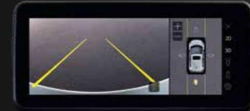
Rear 2D View