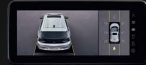
Rear 3D View