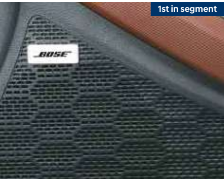
Bose premium sound system (8 speakers)