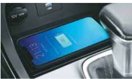
1 st & 2 nd row smartphone wireless charger