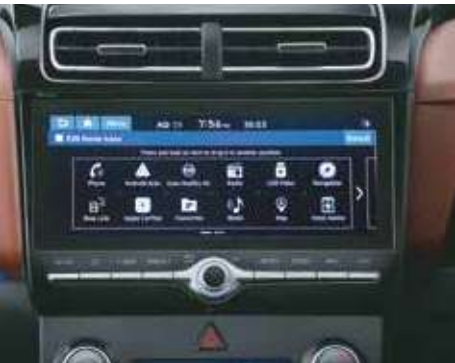
26.03 cm (10.25") HD touchscreen system