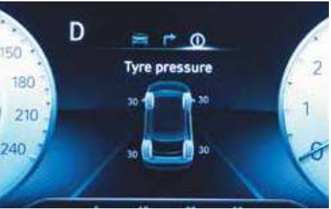
Tyre pressure monitoring system (Highline)