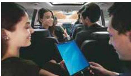
4 USB chargers for 3 rows