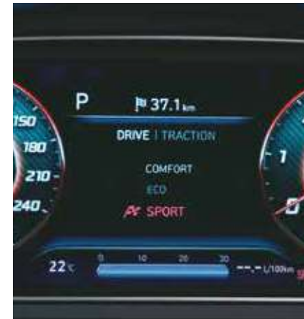
Drive mode select

Other features: Welcome greetings | Voice recognition commands (I want to see the sky / What's the Indian cricket score? / When is the soccer match?) | Bluelink integrated smartwatch app