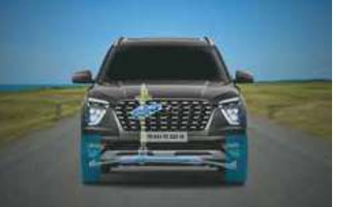
Vehicle stability management (VSM)