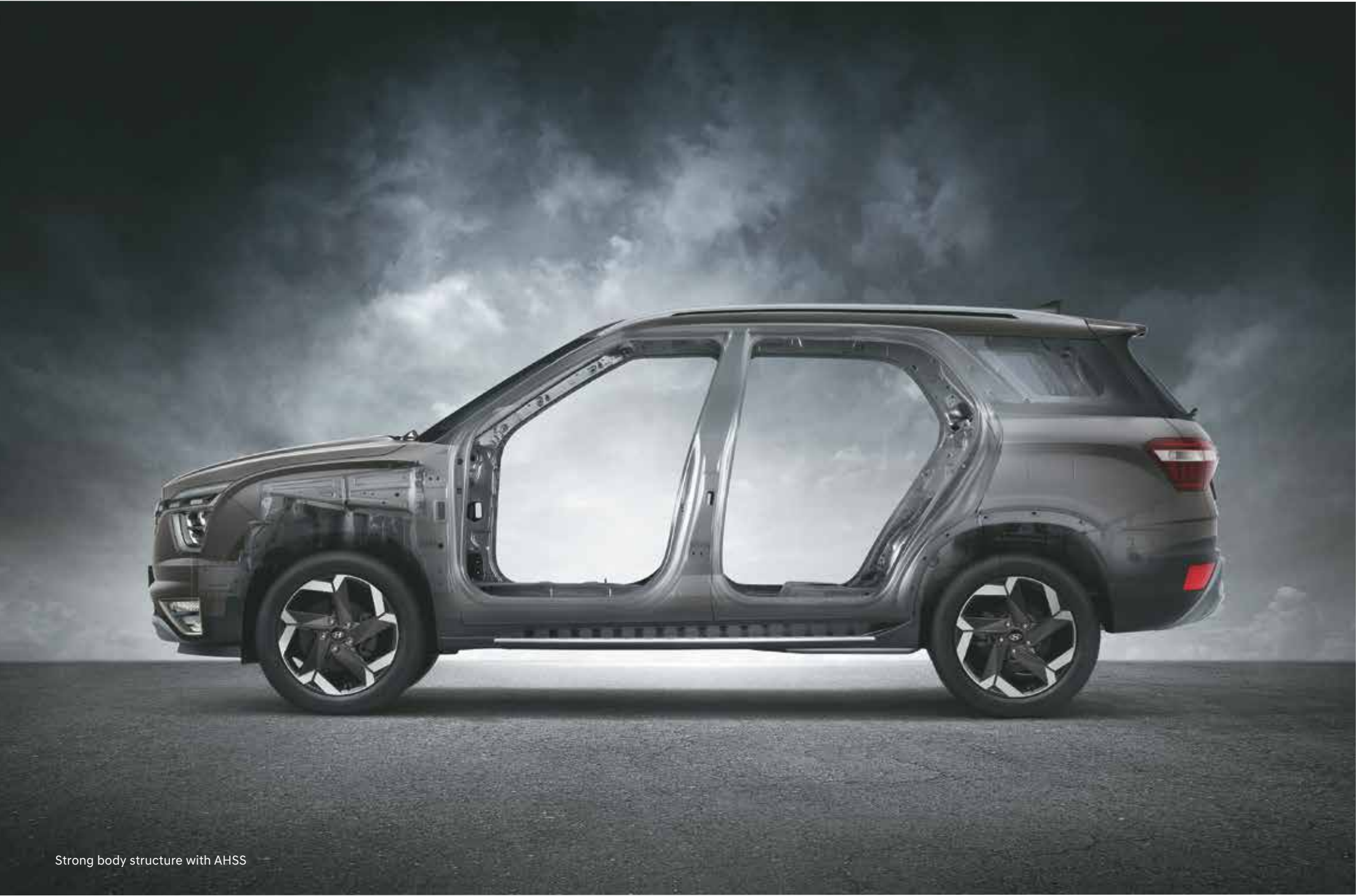
Strong body structure with AHSS