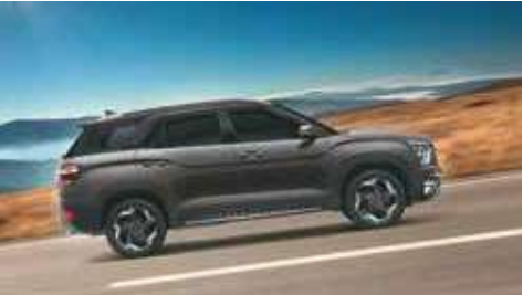
Hill start assist control (HAC)