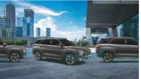
Parking assist: Front and rear parking sensors

Other features: Emergency stop signal | Speed alert system | Speed sensing auto door lock | Driver rear view monitor Impact sensing auto door unlock | Child seat anchor (ISOFIX) | Electric parking brake with auto hold