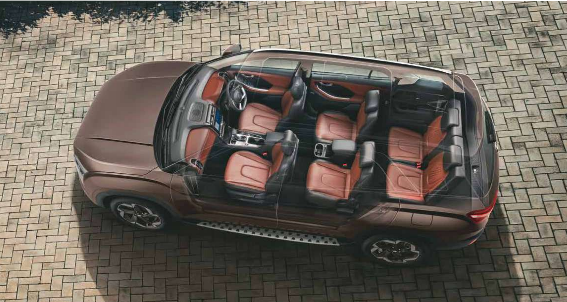
Leather pack: Perforated D-cut steering wheel | Perforated gear knob | Cognac brown and black seat upholstery | Door armrest

The interior of the Hyundai ALCAZAR immerses you in uncluttered design. Complete with premium dual tone cognac brown interiors, the 64 colours ambient lighting offers a regal touch to the cabin. Carefully selected materials accentuate the aesthetic, complete with Hyundai ALCAZAR's advanced technology, ensuring that your entertainment knows no bounds. Experience serenity thanks to a voice controlled panoramic sunroof and an auto healthy air purifier. The tranquil sanctuary is also outfitted with an HD touchscreen system with powerful Bose premium sound system, immersing you in a rich and balanced premium audio experience.