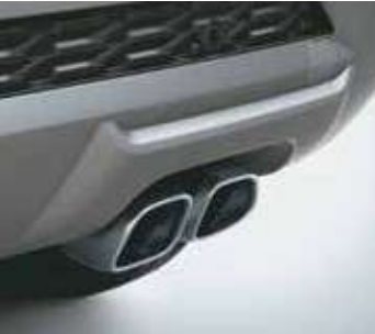
Twin tip exhaust