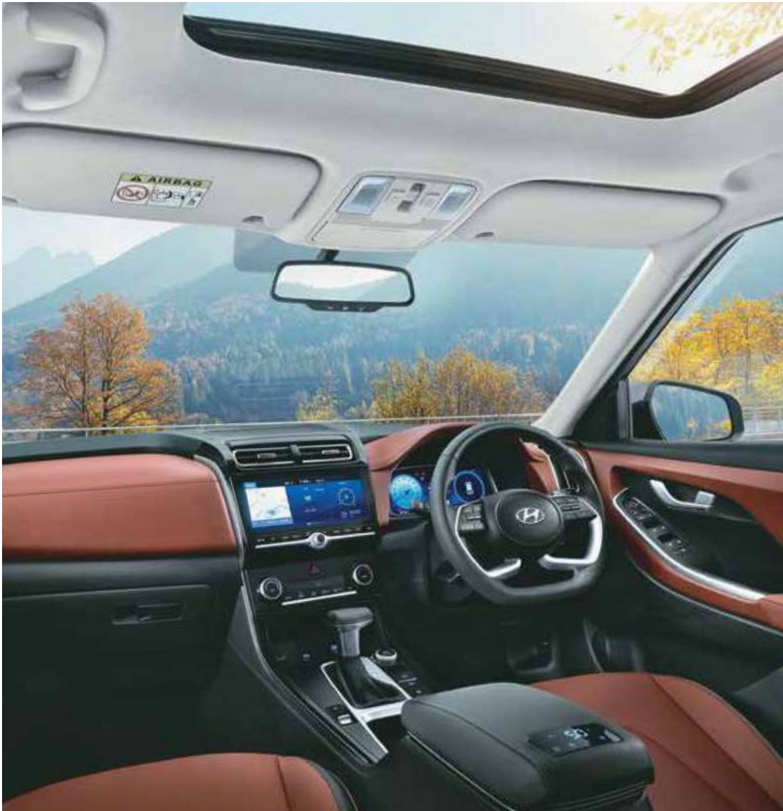
Premium dual tone cognac brown interiors

The interior of the Hyundai ALCAZAR immerses you in uncluttered design. Complete with premium dual tone cognac brown interiors, the 64 colours ambient lighting offers a regal touch to the cabin. Carefully selected materials accentuate the aesthetic, complete with Hyundai ALCAZAR's advanced technology, ensuring that your entertainment knows no bounds. Experience serenity thanks to a voice controlled panoramic sunroof and an auto healthy air purifier. The tranquil sanctuary is also outfitted with an HD touchscreen system with powerful Bose premium sound system, immersing you in a rich and balanced premium audio experience.