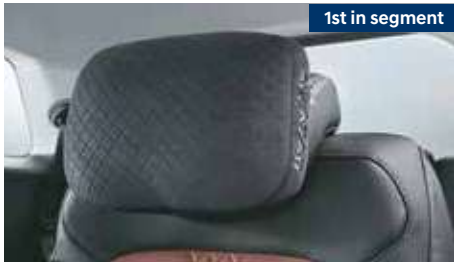
2 nd row headrest cushion