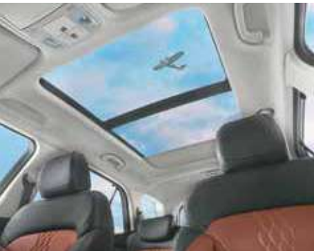
Voice enabled smart panoramic sunroof