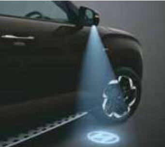
Puddle lamps with Hyundai logo projection