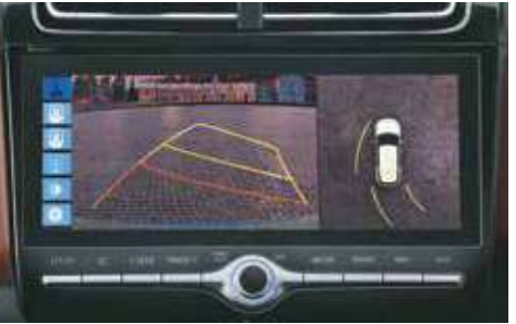
Surround view monitor (SVM)