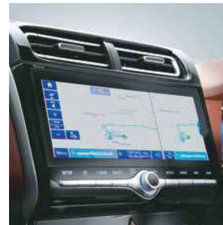
Advanced Bluelink with OTA map updates