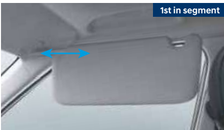
Front row sliding sunvisor