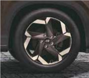
R18 (D=462 mm) Diamond cut alloys