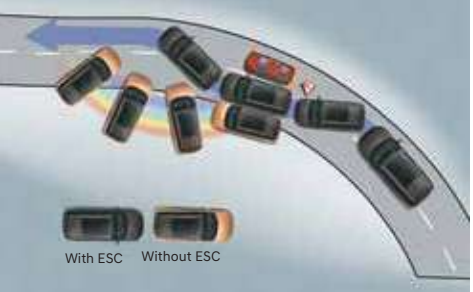
Electronic stability control (ESC)