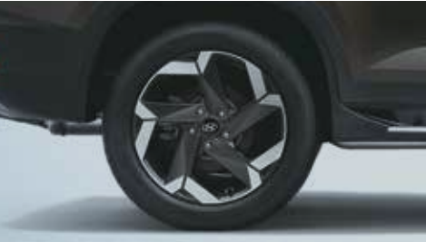
Rear disc brakes