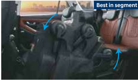
2 nd row - one touch tip tumble captain & split seats