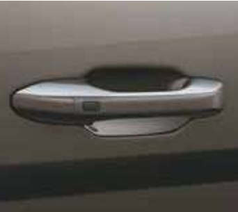
Dark chrome exterior finish outside door handles

Other features: LED positioning lamps | Crescent glow LED DRLs | Trio beam LED headlamps Dark chrome exterior signature cascading grille | LED fog lamps