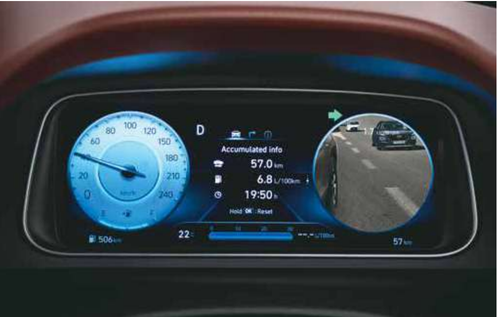
Blind view monitor (BVM)

Each element of the Hyundai ALCAZAR has been designed to provide excellence, in comfort and in safety. Complete with highly accurate front & rear parking sensors and state-of-the-art security alerts like speed alert system, you're always one step ahead of unexpected events on the road. Each journey in the Hyundai ALCAZAR inspires awe and admiration as it carries passengers in uncompromised safety.