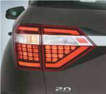
Honey-comb inspired LED tail lamps