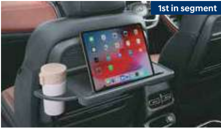
Front row seatback table with retractable cup-holder and IT device holder