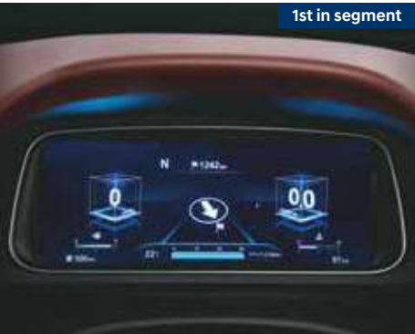
26.03 cm (10.25") Multi display digital cluster with personalized themes