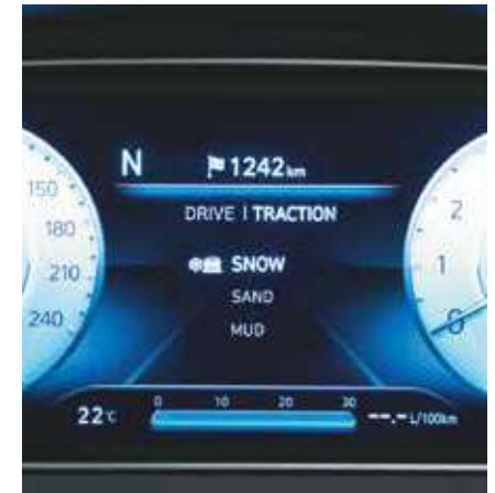
Traction control modes