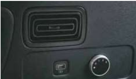
3 rd row AC vents with speed control (3-stage)