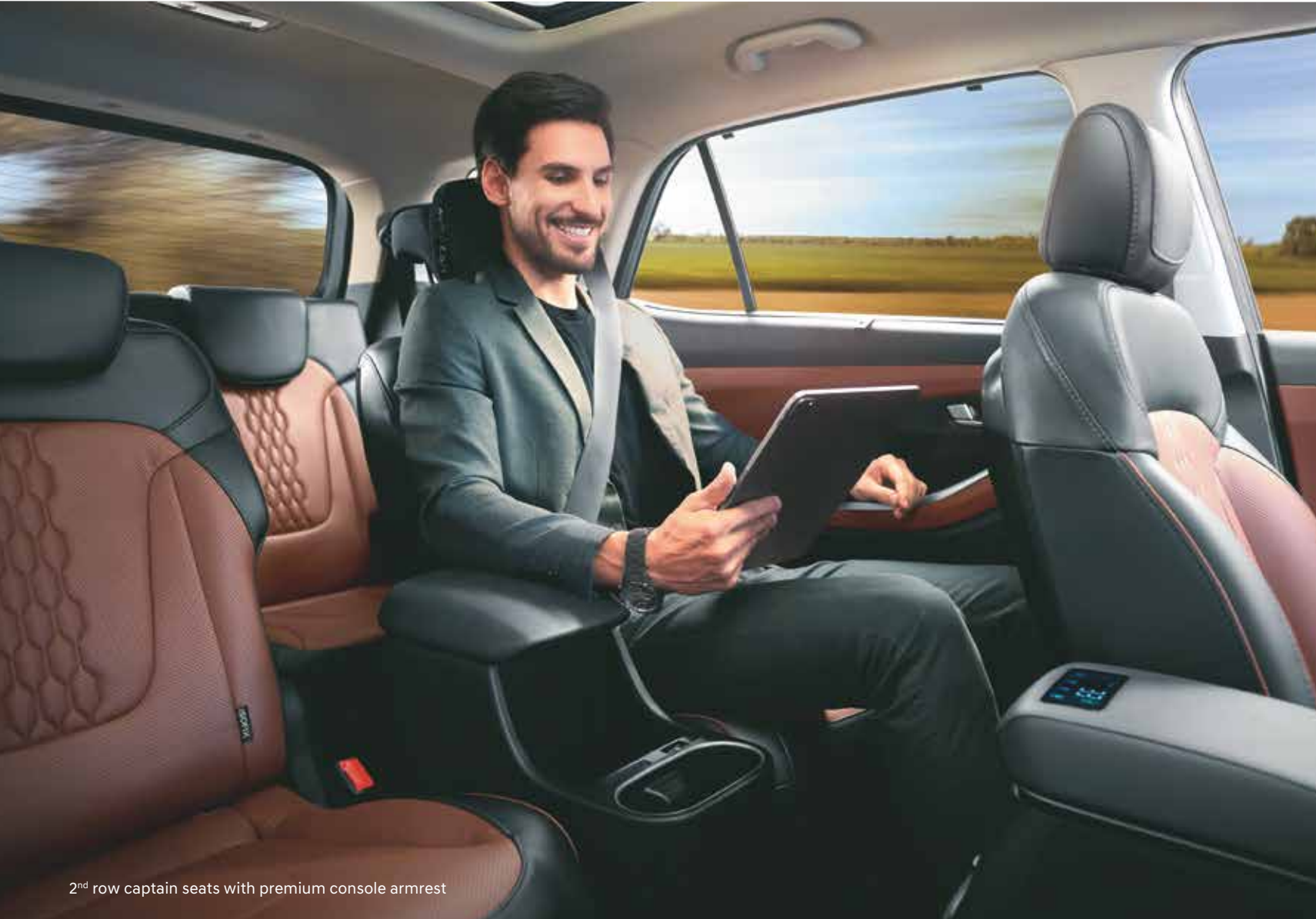
2 nd row captain seats with premium console armrest