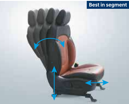
Power driver seat – 8 way