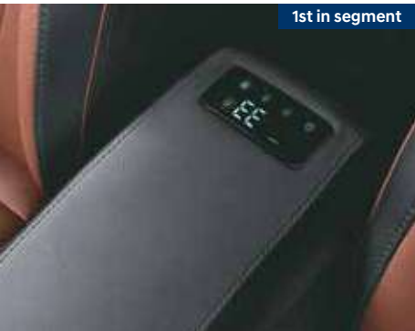
Auto healthy air purifier with AQI display