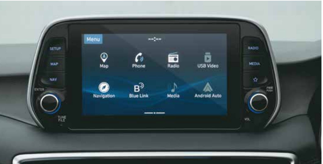
20.32 cm (8 inch) HD audio video navigation system