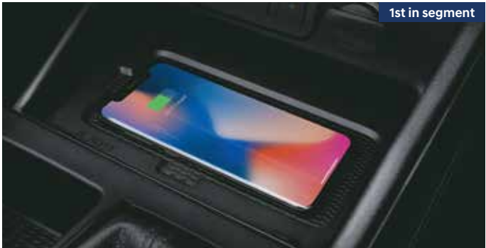
Wireless phone charger

Other features : Rain-sensing wipers | Smart key and push button start | Tilt and telescopic steering | Rear USB charger