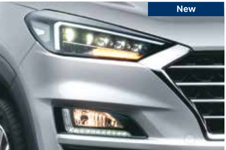
Penta projector LED headlamps with LED DRLs

The new TUCSON exudes class and power in equal measure. Its stylish design, sleek lines and bold stance stand out no matter what environment it is in.