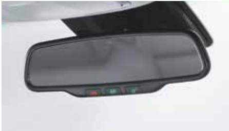
Auto dimming IRVM