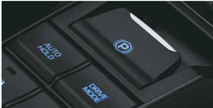
Electric parking brake