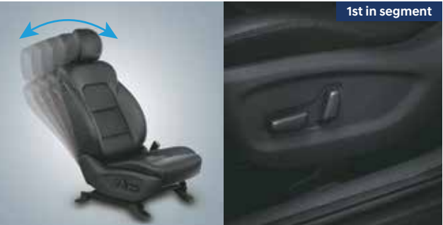
1st in segment