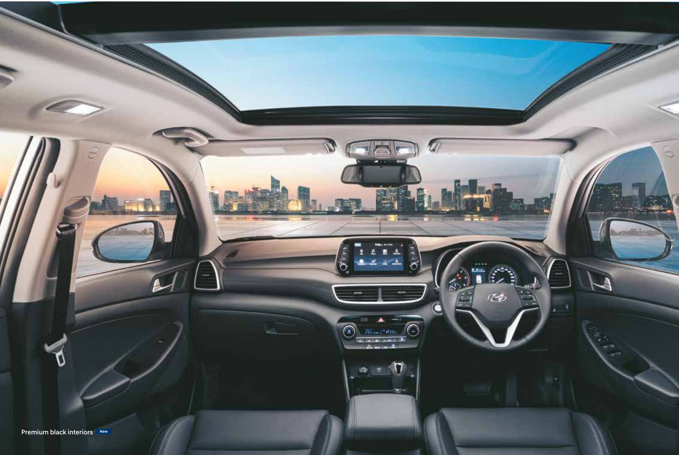
Premium black interiors New