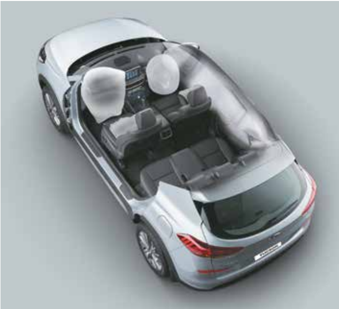
6 Airbags (driver, passenger, front side & curtain)

The new TUCSON has a host of advanced safety features to ensure nothing comes between you and your destinations. Drive with complete peace of mind and enjoy all your journeys.