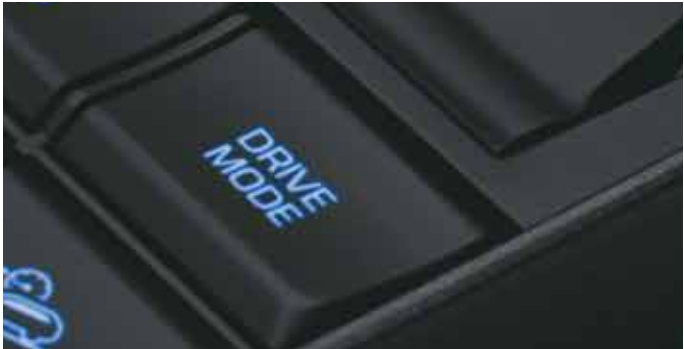
Drive mode select