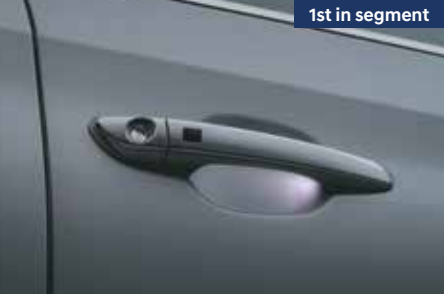
Chrome outside door handles with front pocket lighting

Other features : Twin chrome exhaust (diesel only) | Roof rails | LED static bending lamps | Front & rear fog lamps | Chrome finish beltline