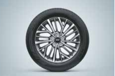
R18 (D=462 mm) diamond-cut alloy wheels