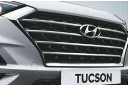
Cascade design bold front grille