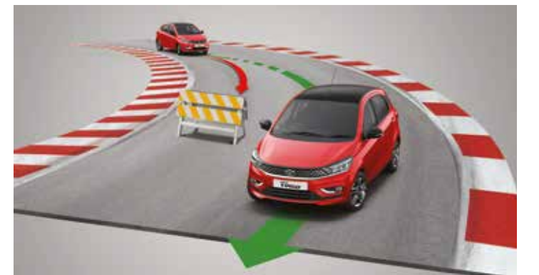
High Strength Body Structure