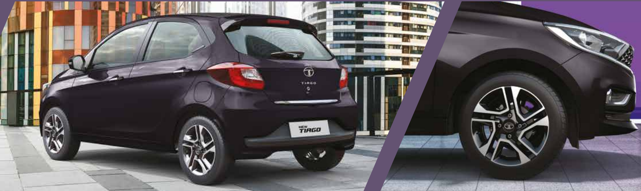
Chrome garnish on Tail Gate and Door Handles