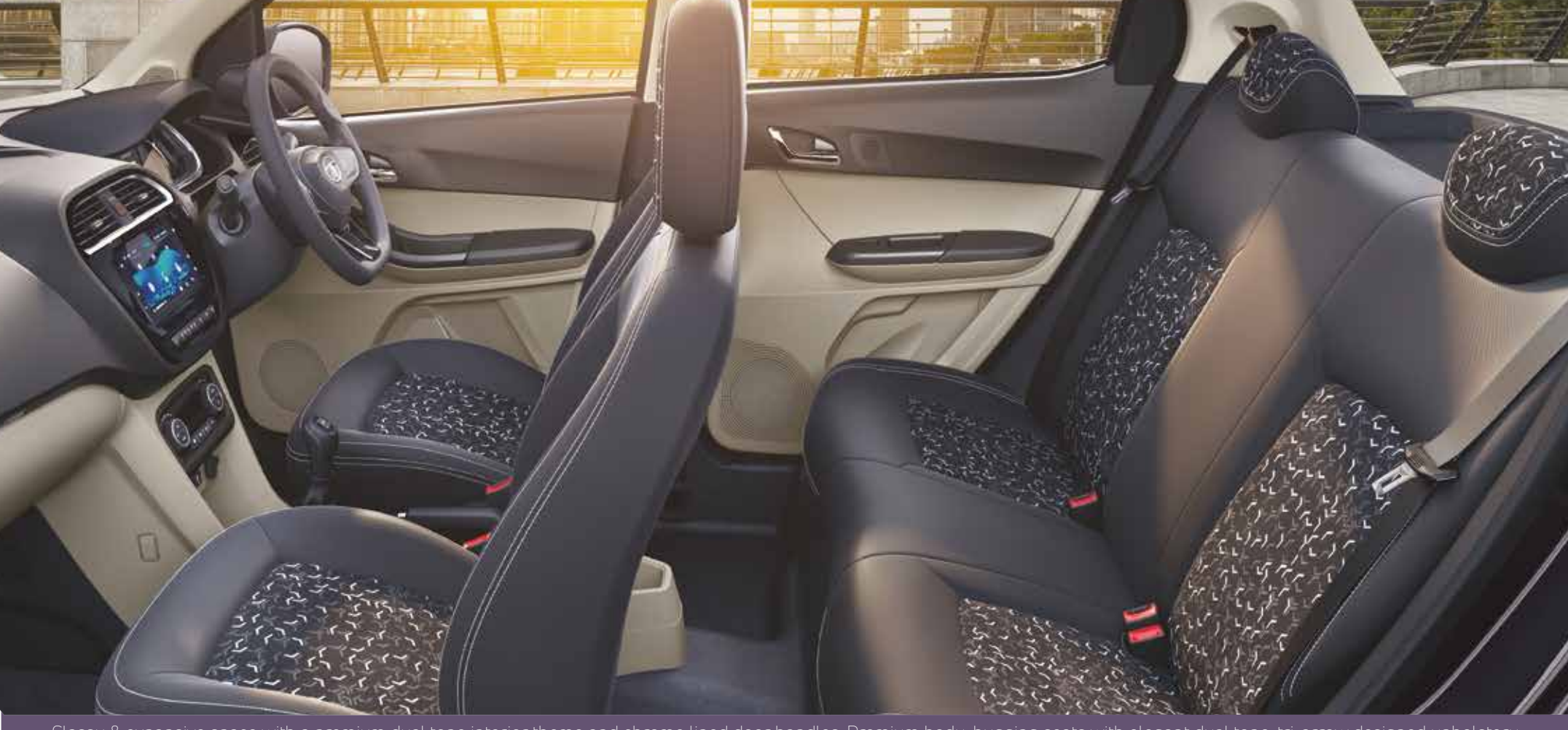
Classy & expansive space with a premium dual tone interior theme and chrome lined door handles. Premium body-hugging seats with elegant dual tone, tri-arrow designed upholstery