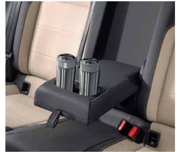
Cupholders In The Armrest