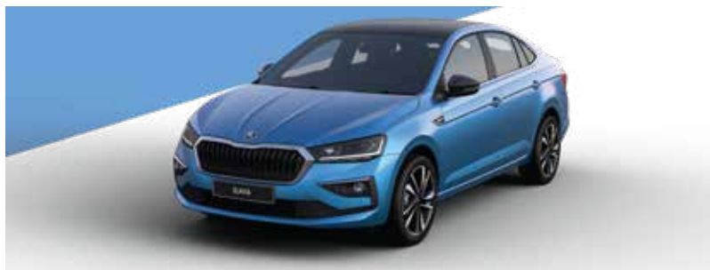
Crystal Blue With Carbon Steel Roof