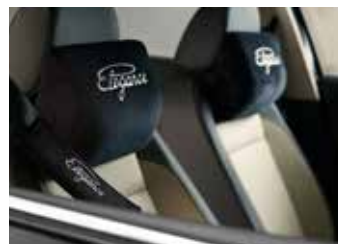
'Elegance' Seat-Belt Cushions & Neck Rests