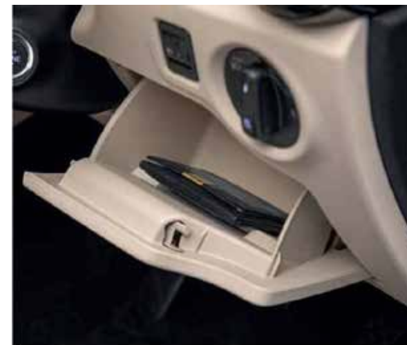
Driver Storage Compartment