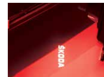
Puddle Lamp with Škoda Logo Projection