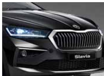
Radiator Chrome Grill