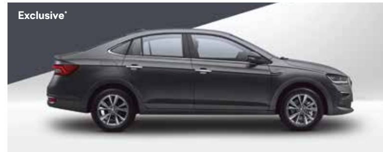
Slavia Matte Edition