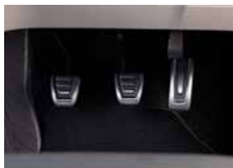
Textile Mat & Aluminium Pedal