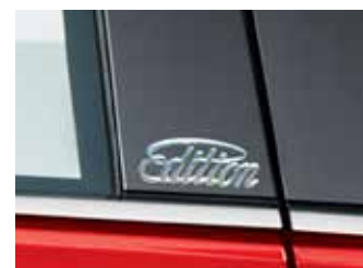
Exclusive B-Pillar Edition Badging