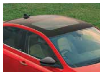
Black Roof Foil with Electric Sunroof