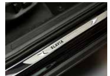
Scuff Plate with 'Slavia' Inscription