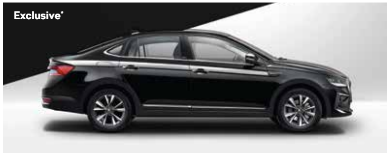
Slavia Elegance Edition - Deep Black