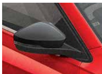
Black Mirror Cover