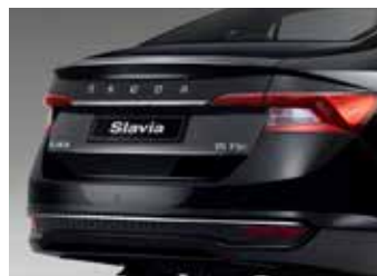
Chrome Side & Trunk Garnish