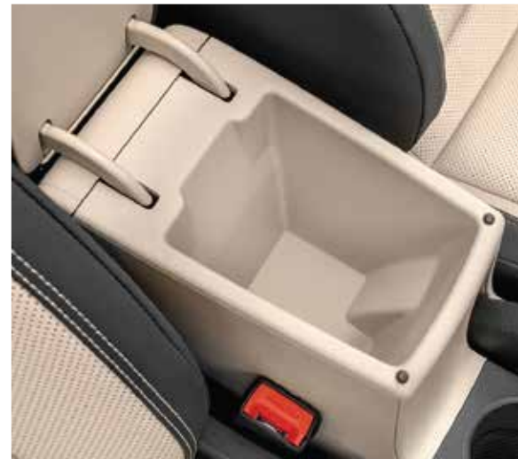
Storage In Front Centre Armrest