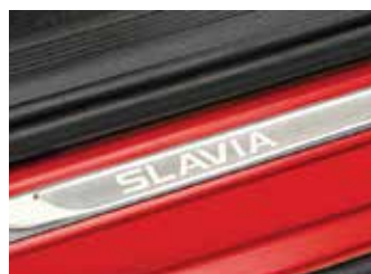
Slavia Scuff Plate