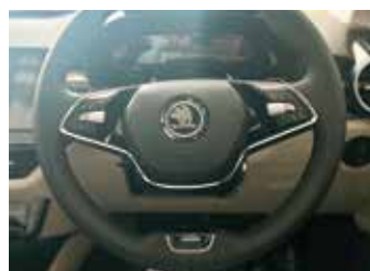
Steering Wheel Edition Badge