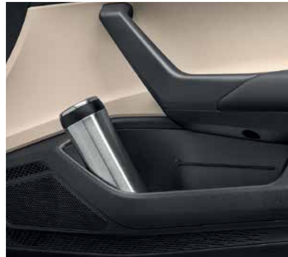
Storage In Front And Rear Doors