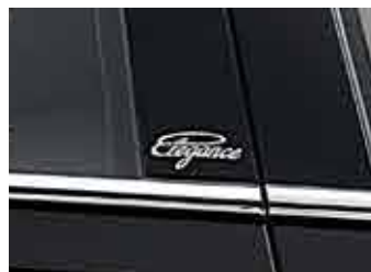
'Elegance' Badge on B-Pillar