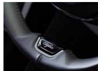
Steering Wheel 'Elegance' Badge