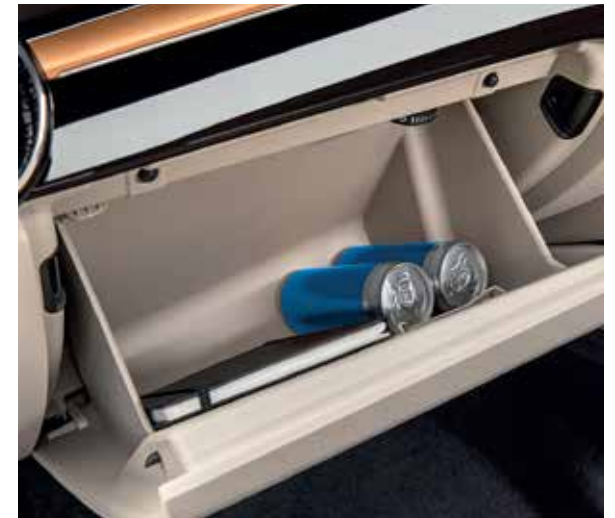
Cooled Glove Box