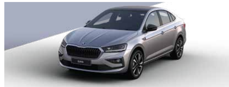
Brilliant Silver With Carbon Steel Roof