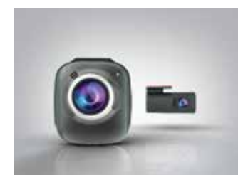
Latest Dual Dash Cam