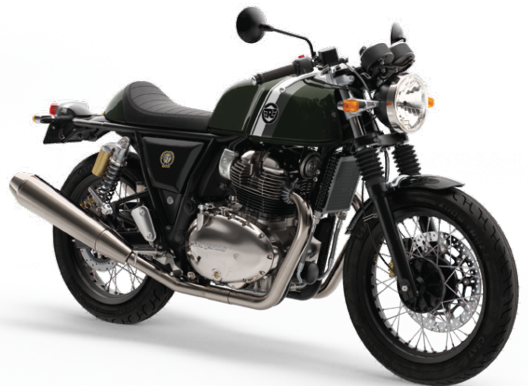
British Racing Green