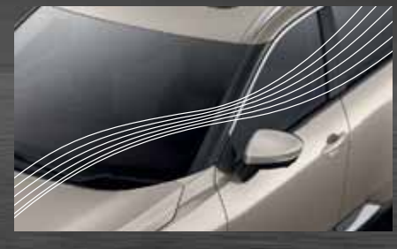
A-Pillar Shape Optimisation

The Nissan X-TRAIL has been specially designed to reduce wind noise and resistance to offer a quieter cabin experience.