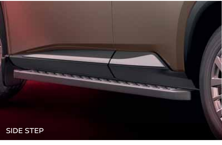
Add functionality & style to your Nissan X-TRAIL with a set of rugged side steps. Provides a step up into the vehicle, as well as easy access to the roof.