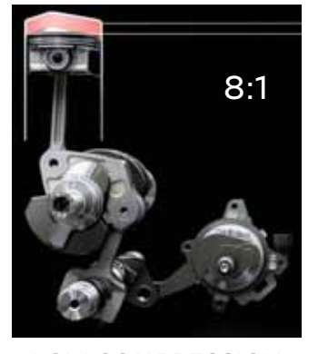
LOW COMPRESSION HIGH POWER