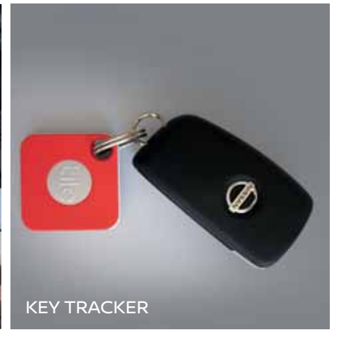
Get peace of mind with the advanced key tracker for your X-TRAIL. Track your keys in real time and quickly locate them if they are misplaced.

Disclaimer-> Terms & Conditions apply. Nissan Motor India Private Limited reserves the right to make any changes without notice concerning colours, equipment, pricing or specifications detailed in this brochure, or to discontinue individual accessories. Accessories pricing excludes fitment charges. Dealer may charge fitment charges as extra. Contact your nearest Nissan dealer for more details.