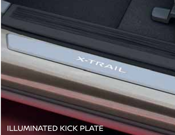
Designed to protect your car from scuff marks caused by footwear, these elegant X-TRAIL branded illuminated kick plates add a truly premium touch.