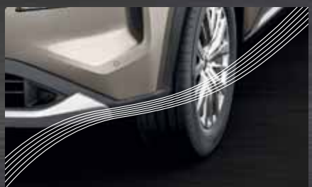
3D Tyre Deflectors