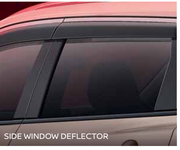
Keeps your side windows clear of rain, snow or dust when you are on the road.