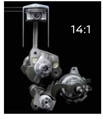
HIGH COMPRESSION HIGH FUEL EFFICIENCY