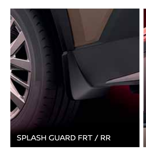
Essential to protecting your Nissan X-TRAIL from mud and road debris.