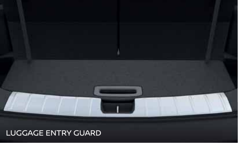
The thoughtfully designed Luggage Entry Guard protects the rear bumper while loading and unloading luggage.