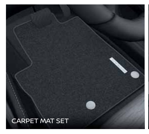
Protect the floor of your Nissan X-TRAIL with a set of customised carpet floor mats.