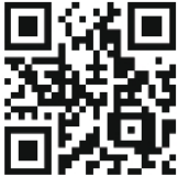
Converter and controller replacement

Scan the below QR codes to explore our simple vehicle care guide.