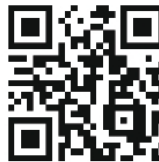
Save battery while in idle condition