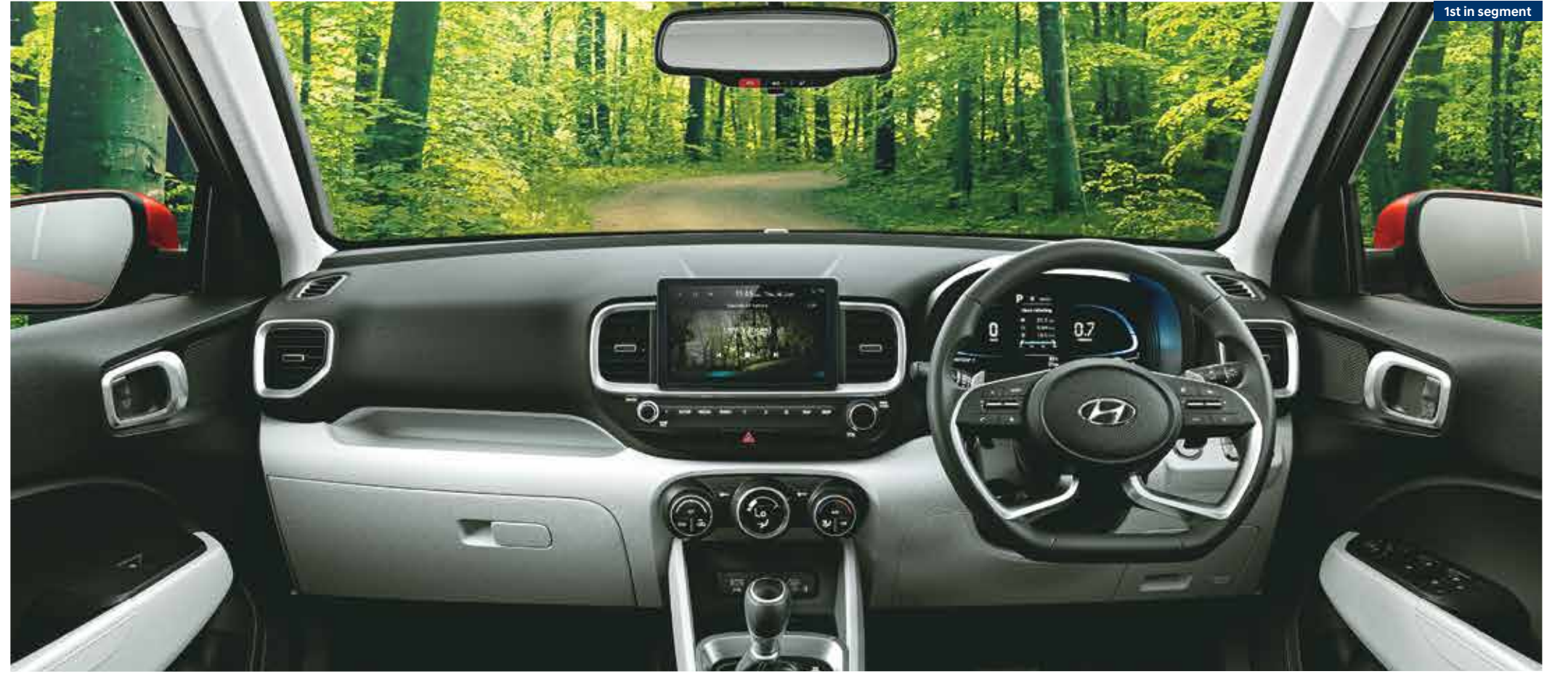
Ambient sounds of nature in the 20.32 cm (8.0") HD infotainment system