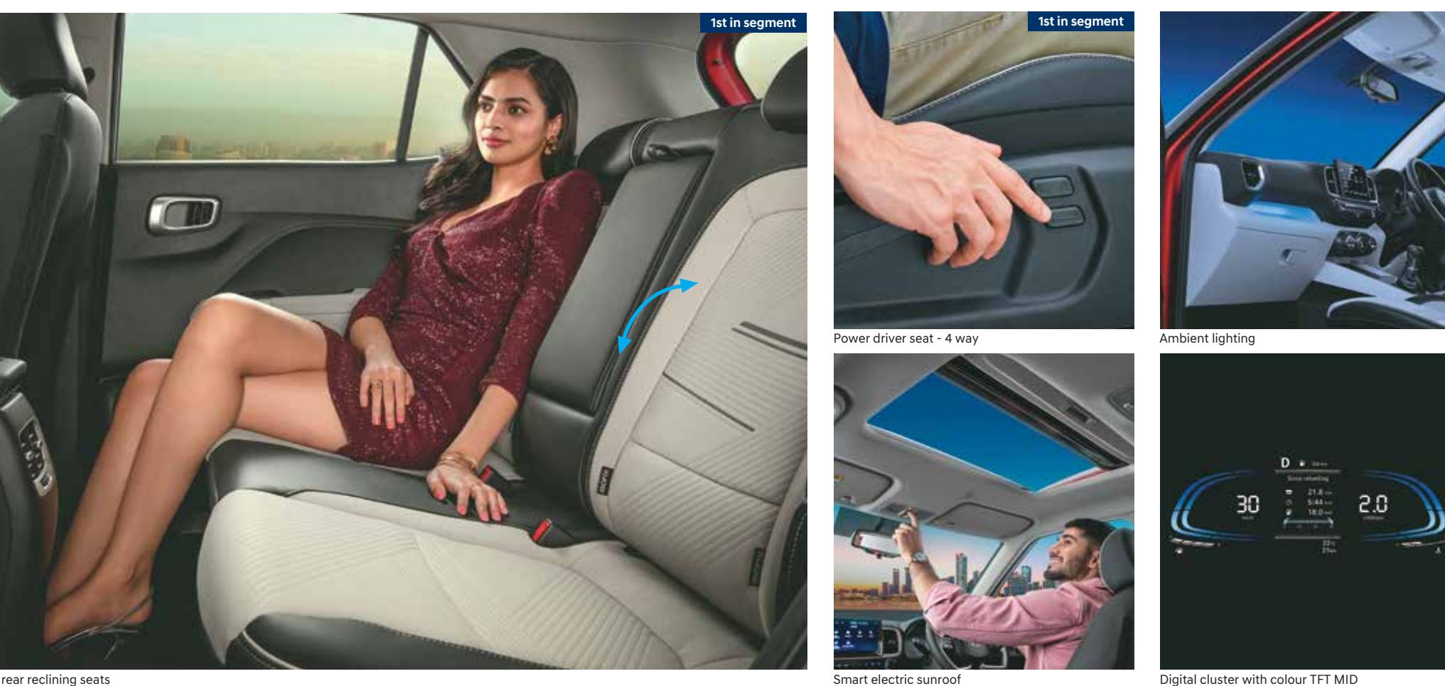
2-step rear reclining seats

From home to work to everywhere you want to be, you need to be surrounded in a place that's inherently you. And inside the new VENUE all that matters, is you. Stylish, refined and exciting, it's got it all. Embracing the lit life the new Hyundai VENUE is focused on fun and comfort rolled into one incredible package that makes sure it looks just as trendy inside, as it does outside.