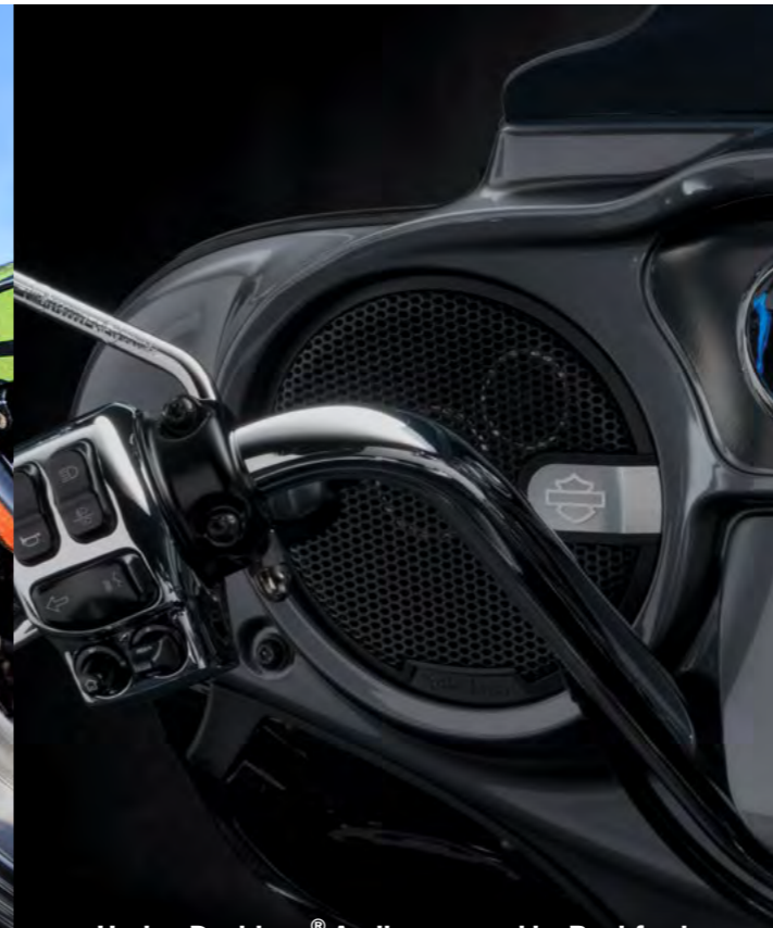
Harley-Davidson® Audio powered by Rockford Fosgate® Stage II Fairing Speakers.