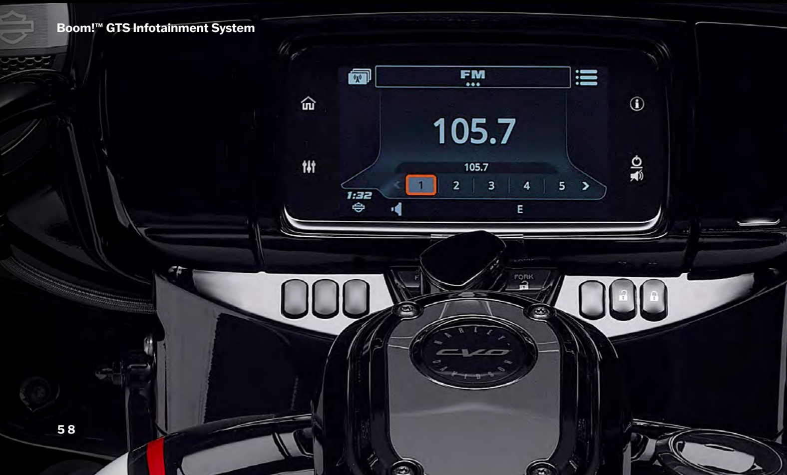
Boom!™ GTS Infotainment System