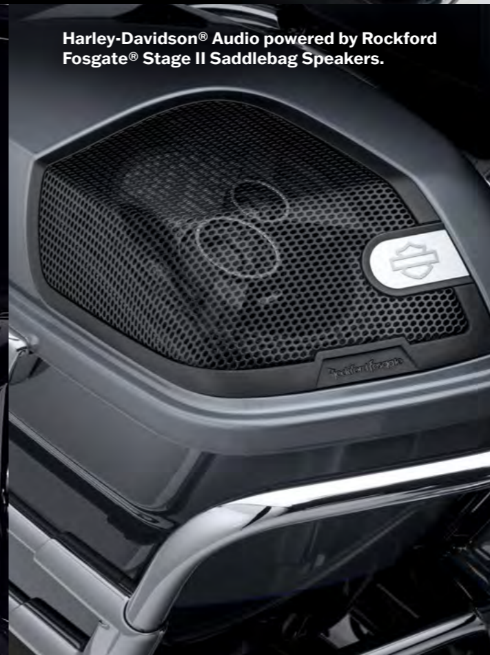
Harley-Davidson® Audio powered by Rockford Fosgate® Stage II Saddlebag Speakers.

Milwaukee-Eight™ Twin-Cooled™ 117 Engine The most powerful V-Twin engine ever offered from the H-D® factory, and only available in CVO™ models. Features colour accented Rocker Box Lower with Blaze Red finish.