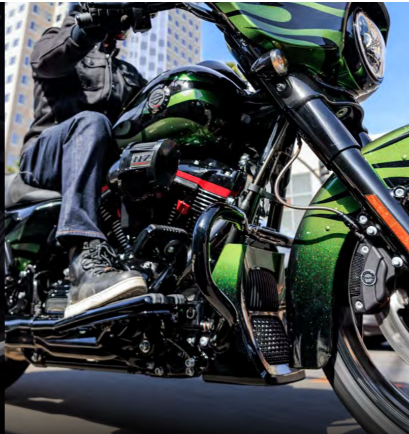
REFLEX™ Defensive Rider Systems