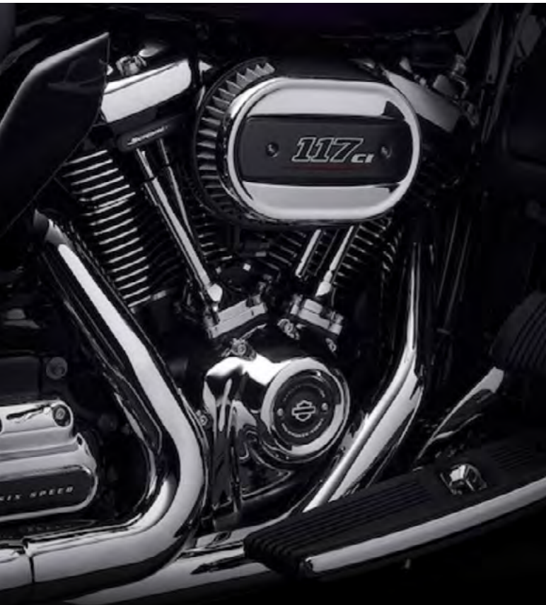
Milwaukee-Eight™ Twin-Cooled™ 117 Engine