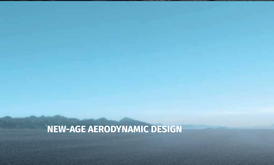
NEW-AGE AERODYNAMIC DESIGN