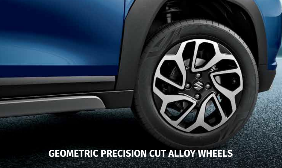
GEOMETRIC PRECISION CUT ALLOY WHEELS