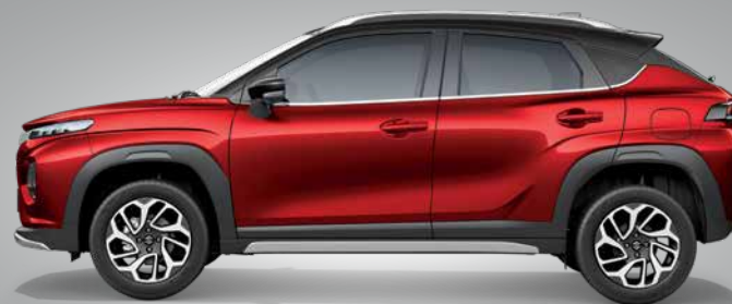
OPULENT RED + BLUISH BLACK