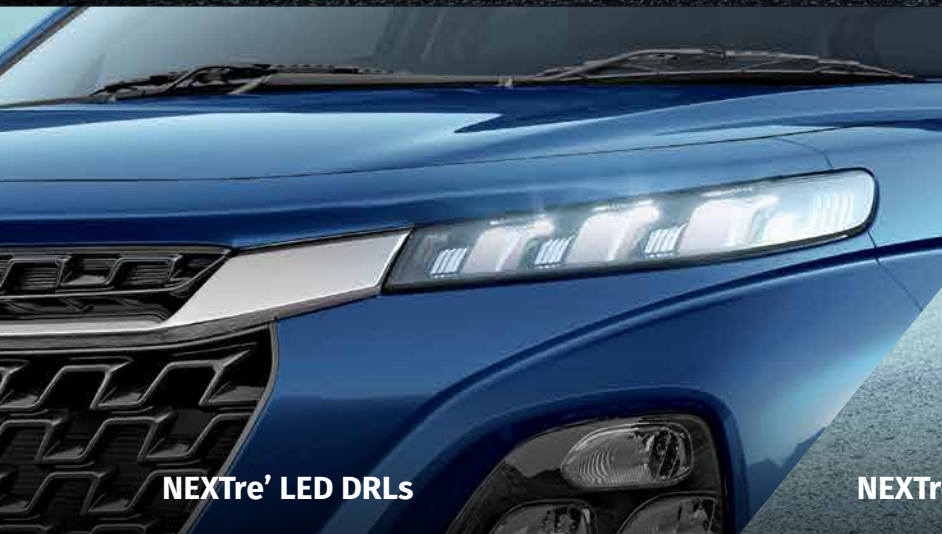
NEXTre' LED DRLs