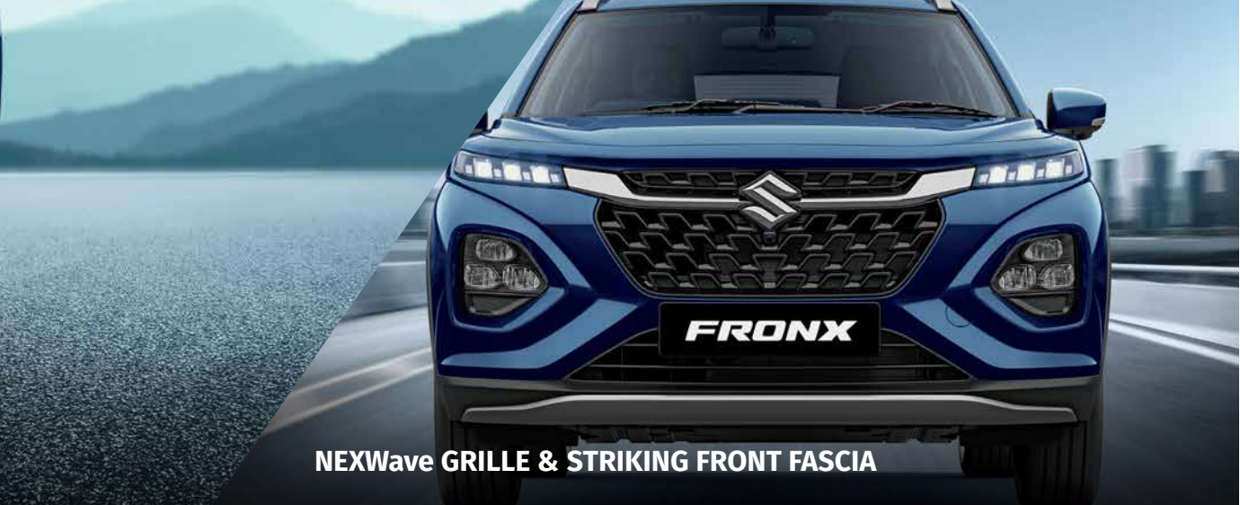
NEXWave GRILLE & STRIKING FRONT FASCIA