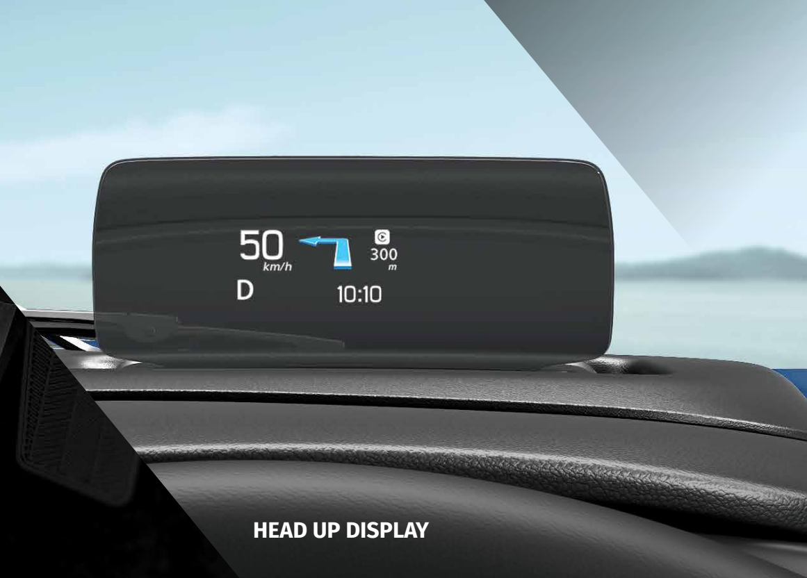
HEAD UP DISPLAY