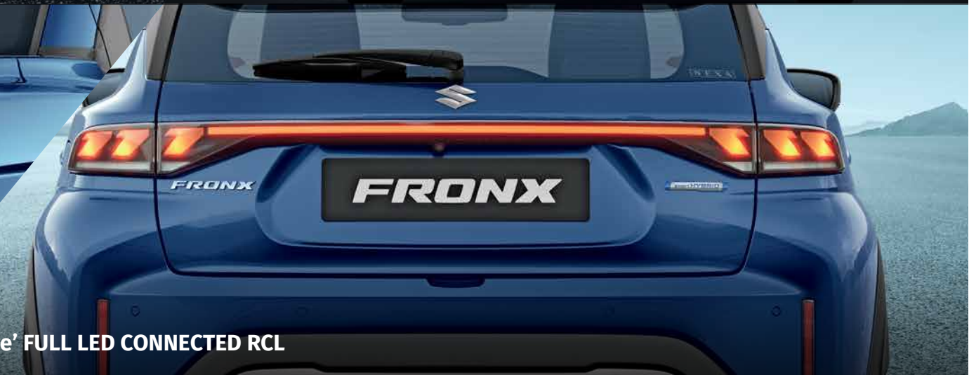
NEXTre' FULL LED CONNECTED RCL