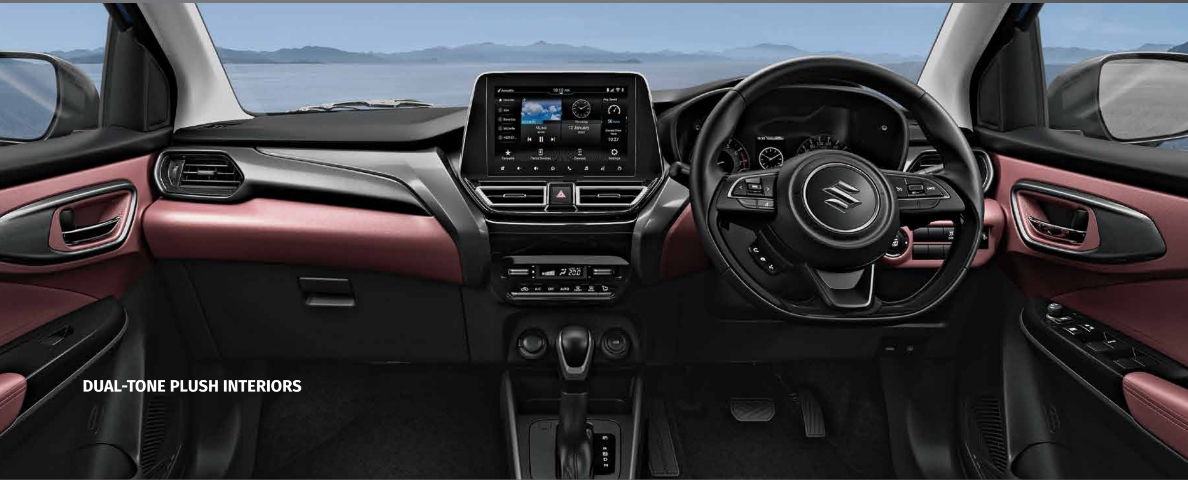
DUAL-TONE PLUSH INTERIORS

From the moment you step in, FRONX enhances the SUV experience with its structural precision and integrated function. The dual-tone dashboard with special forged metal finish and accents seamlessly connects the steering, infotainment system and rounds off the interiors in style. Cruise control and steering-mounted controls ensure you never have to take your hands off the wheel. What amps up the luxury for you, and yours, are details like the driver armrest; rear AC vents; and rear fast charging.