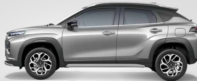
SPLENDID SILVER + BLUISH BLACK