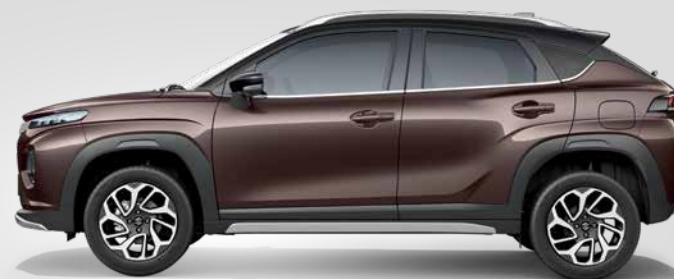
EARTHEN BROWN + BLUISH BLACK