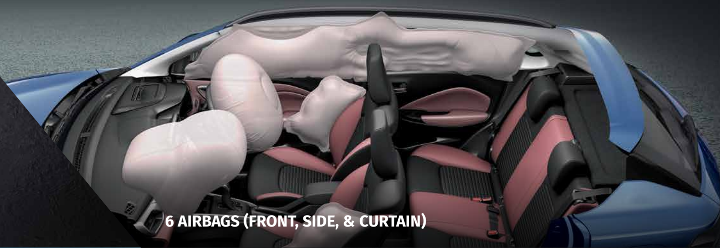
6 AIRBAGS (FRONT, SIDE, & CURTAIN)