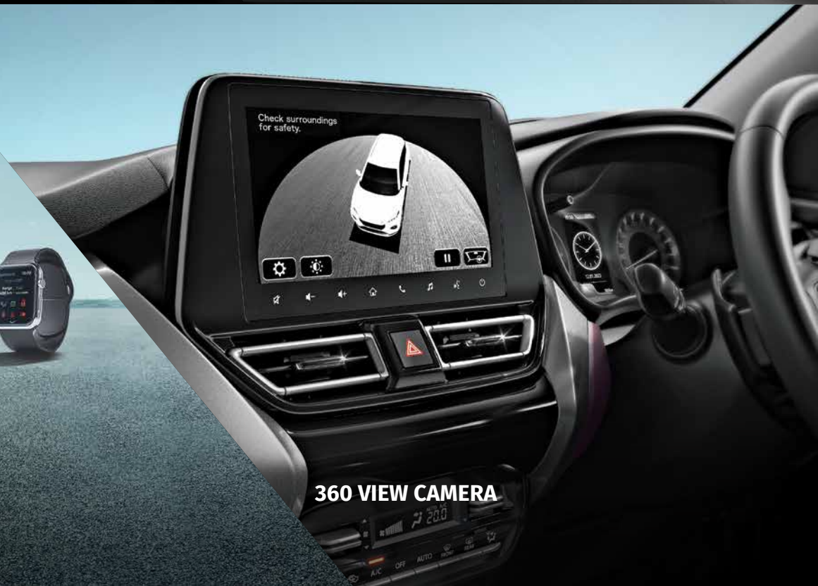
360 VIEW CAMERA