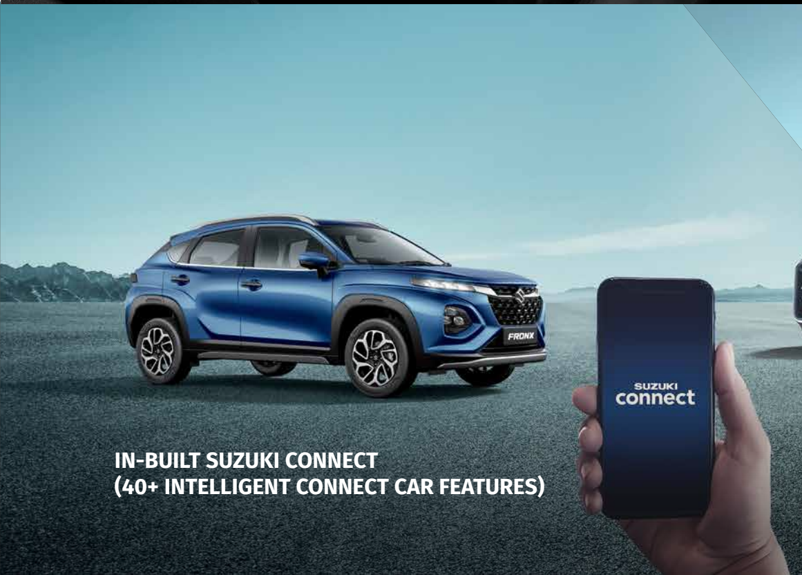
IN-BUILT SUZUKI CONNECT (40+ INTELLIGENT CONNECT CAR FEATURES)