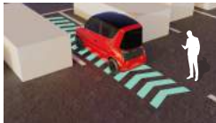
Remote Parking Assist