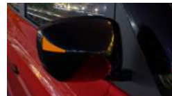
Turn light integrated ORVM