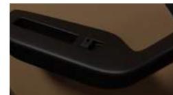
USB Phone charging