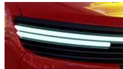
Mean twin signature lights