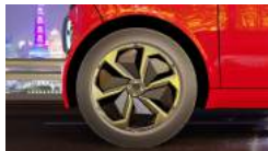
Sharp alloy wheels