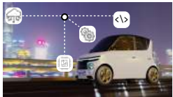
Over The Air Updates