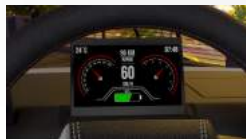
Digital Instrument cluster

Sleek interiors with big roomy personal cabin to keep you serene & calm. Add to that the right amount of gadgetry to make the drive easy & comfortable.