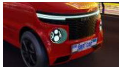
Muscular alpha front grille