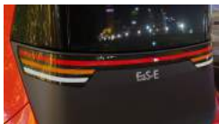
Futuristic tail lights

Bold is for the self-assured and strong. They drive a revolution to make the world a better place. Embrace the design that drives you into the future.