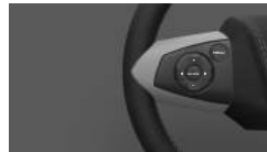
Smart Steering controls