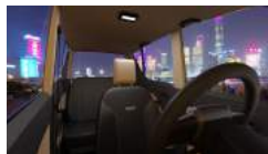
Plush interior color tones