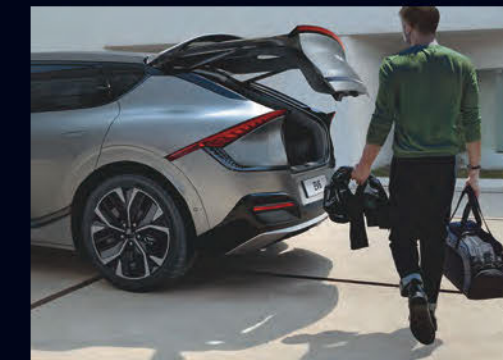
Smart Power Tailgate The power tailgate can be set to open automatically to a desired height