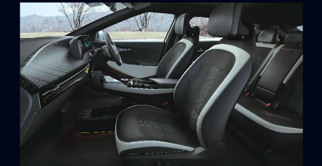
Black Interior - Black Suede Seats with Vegan Leather Bolsters