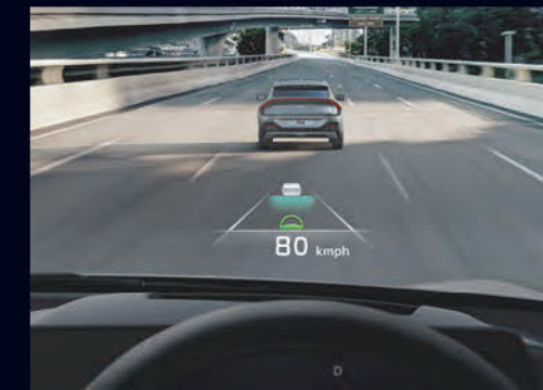
Augmented Reality Head-up Display Key information such as speed, lane safety indication, is projected in an intuitive manner on the windscreen

Let our technology handle the details, so you can stay connected to the journey. By prioritising information, the fully electric Kia EV6 lets you take in more of the world outside, and spend less time scanning screens and dials. This is what makes EV6 the most convenient electric vehicle on the streets.