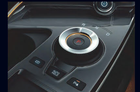
Shift By Wire Change gear position simply by turning the dial of Shift by Wire system left or right