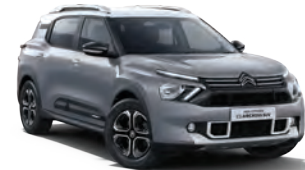
STEEL GREY BODY WITH POLAR WHITE ROOF