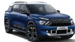
COSMO BLUE BODY WITH POLAR WHITE ROOF