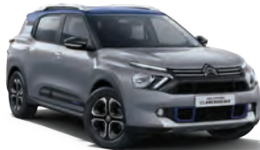
STEEL GREY BODY WITH COSMO BLUE ROOF