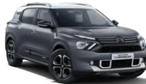
PLATINUM GREY BODY WITH POLAR WHITE ROOF