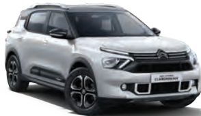
POLAR WHITE BODY WITH PLATINUM GREY ROOF