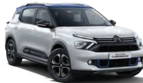
POLAR WHITE BODY WITH COSMO BLUE ROOF