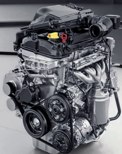
ADVANCED K-SERIES DUAL JET, DUAL VVT SMART HYBRID ENGINE