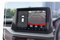
360 View Camera