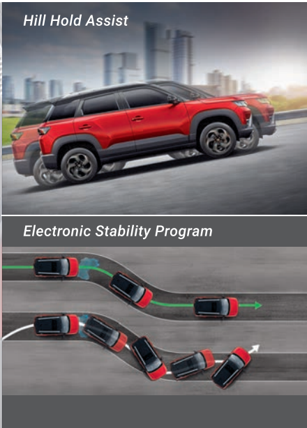
Hill Hold Assist