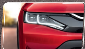
Dual LED Projector Headlamps with LED DRLs