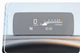
Head Up Display