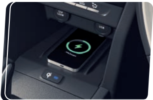
Wireless Charging Dock

The Hot and Techy Brezza carries a youthful and exciting appeal on the inside with your convenience at its core. It gets a unique design, modern and sleek look and black and brown interiors with silver accents for a sporty and urban feel. The City-Bred SUV also has Rear AC Vents, a Fast Charging USB Port (Type A and C) and a flat bottom Steering Wheel for your enhanced comfort and convenience. The 6-Speed Automatic Transmission with Paddle Shifters and Telescopic Steering ensure you go on city adventures comfortably.