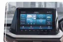
SmartPlay Pro+ with Surround Sense powered by ARKAMYS