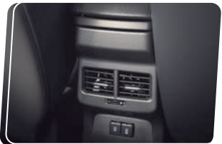
Rear AC Vents with Fast Charging USB Ports