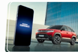
Next Gen Suzuki Connect