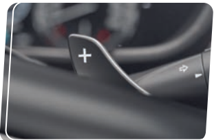
6-Speed AT with Paddle Shifters