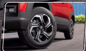
Bold Geometric Alloy Wheels